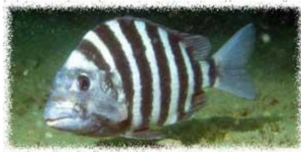
*Sheepshead Archosargus probatocephalus