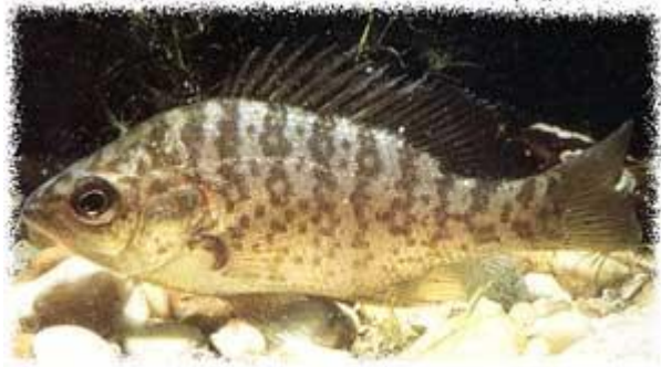
Redear Sunfish Lepomis microlophus