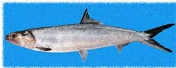
*Lady Fish Elops suarus