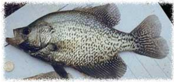
Black Crappie Pomoxis nigromaculatus