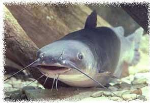
Blue Catfish Ictalurus furcatus