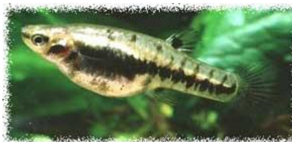
Least Killifish Heterandria Formosa