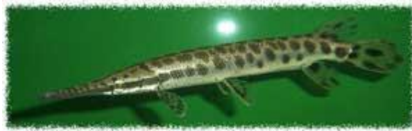
Spotted Gar Lepisosteus oculatus