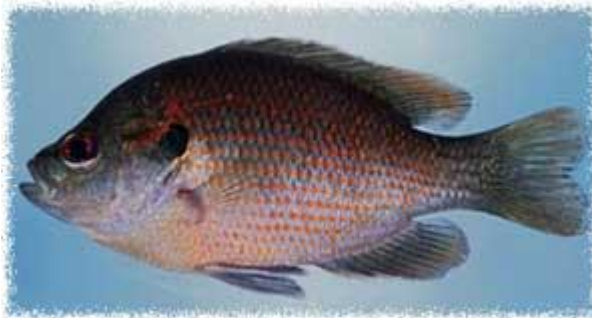
Redspotted Sunfish Lepomis miniatus