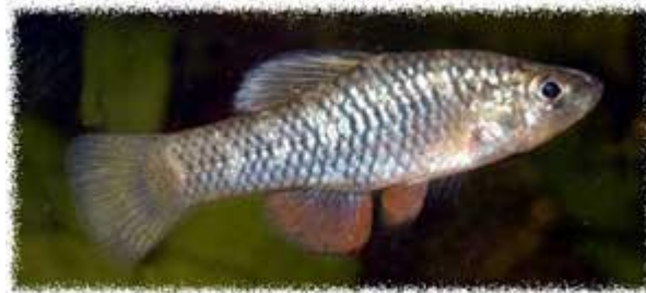
Rainwater killifish Lucania parva