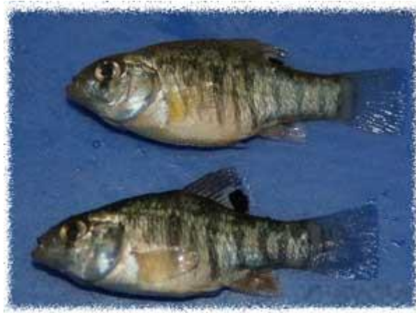
Sheepshead Minnow Cyprinodon variegatus