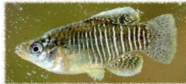
Diamond Killifish Adinia xenica