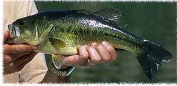
Largemouth Bass Micropterus salmoides

Fish you'll likely see in City Park/Bayou St. John waters: