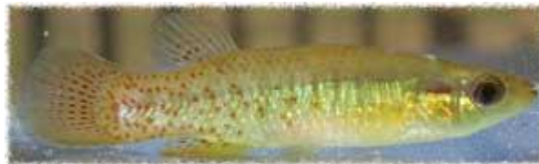
Golden Topminnow Fundulus chrysotus