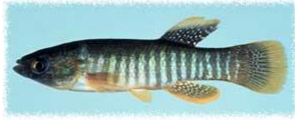
Gulf Killifish Fundulus grandis