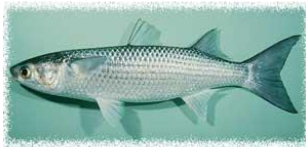
*Striped Mullet Mugil cephalus

Check out www.NewOrleansCityPark.com for information on the annual fishing competition the Big Bass Rodeo & for information on fishing records in the Park.