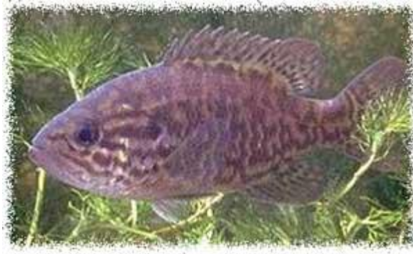
Warmouth Lepomis gulosus