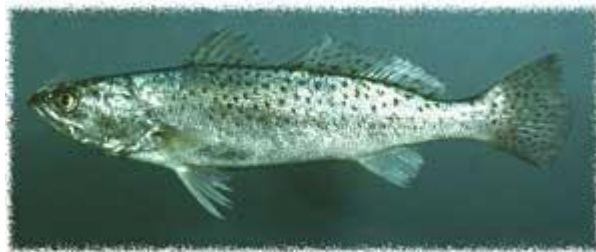
*Spotted Sea Trout (Speckled)