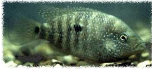
Rio Grade Chiclid Herichthys cyanoguttatus