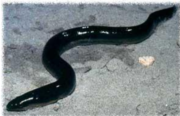
American eel Anguilla rostrata