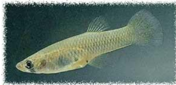
Mosquito Fish Gambusia affinis