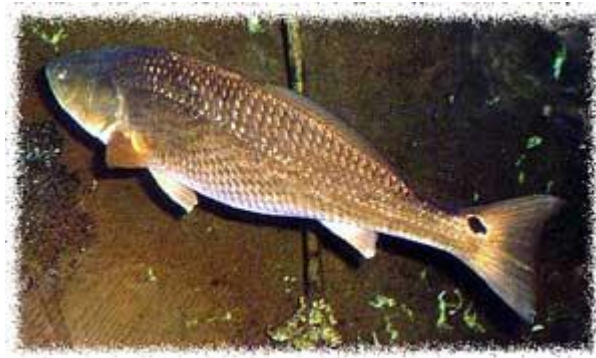
*Red Drum (Redfish)