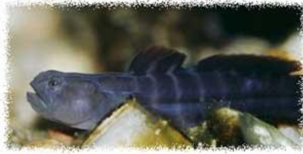
Naked Goby Gobiosoma bosc