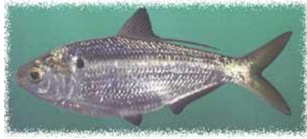
Theadfin shad Dorosoma petenense