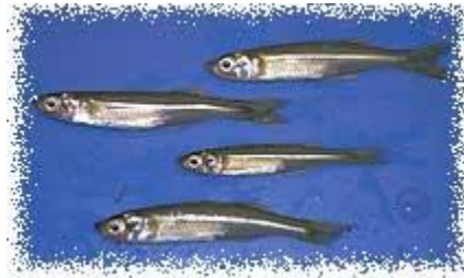
Inland Silverside Menidia beryllina